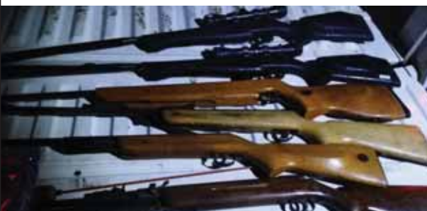
All six firearms stolen, were recovered.